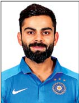
Virat Kohli will lead Indian team in all three formats of the game against Australia