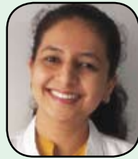
By: Dr. Aditi Mahajani

index finger, guide the floss between two teeth with a gentle sliding back and forth motion from the gums towards the edge of the tooth. One can start from one side and move on to the other and clean both upper and lower